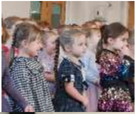
REC & KS1 Performance