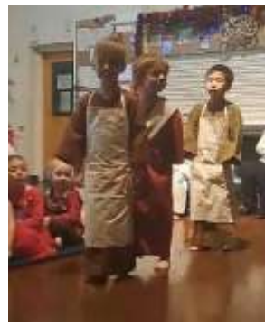
Visit from Santa